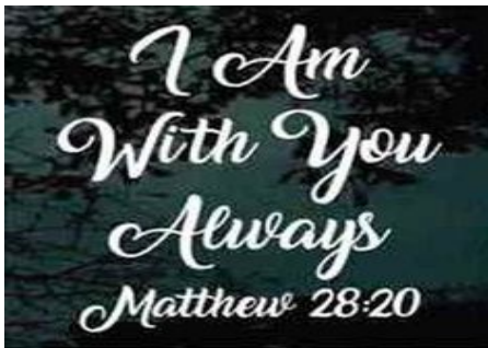
Jesus is the Only WAY